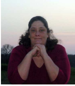
300 dpi download